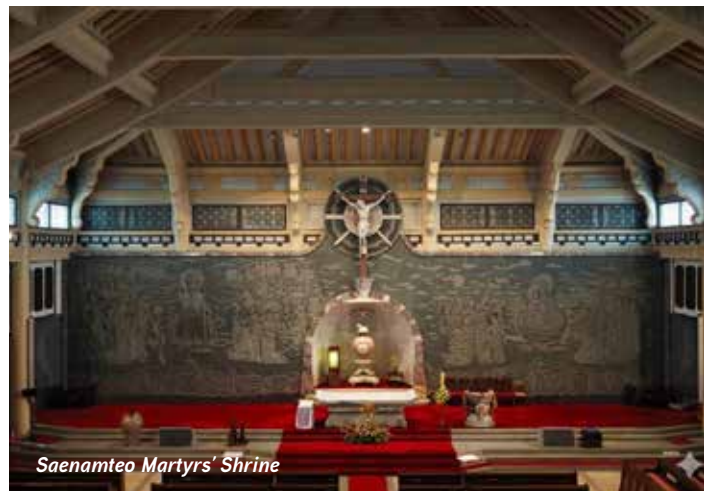
Saenamteo Martyrs' Shrine