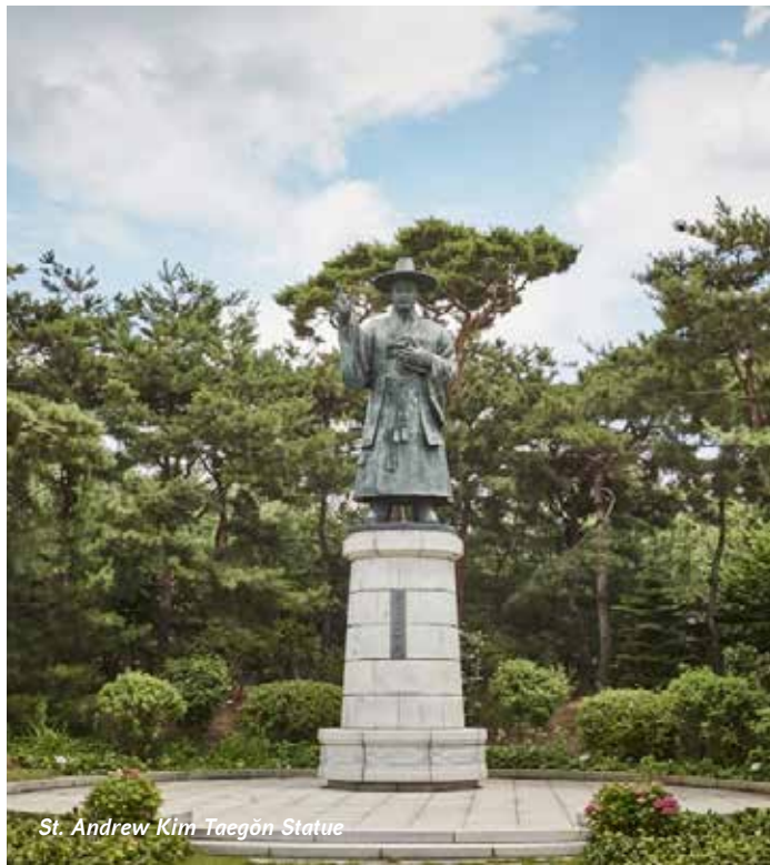
St. Andrew Kim Taegon Statue

The festival continues with further catechesis and a full day of cultural and prayerful activities throughout the city. These are days to encounter the Church not as an idea but as a living family – to make friendships that cross oceans, and to discover that the courage of the Korean martyrs still beats in the young Church of today. (B, D, Mass)