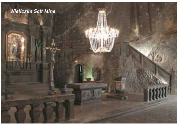
Wieliczka Salt Mine