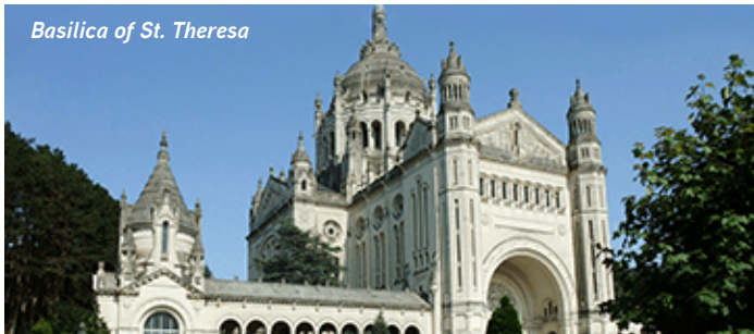
Basilica of St. Theresa

After Mass, depart Lisieux and drive along the Normandy coast to see the beaches where the Allies landed on D-Day. Proceed to St. Laurent to visit the National Cemetery and Omaha Beach, one