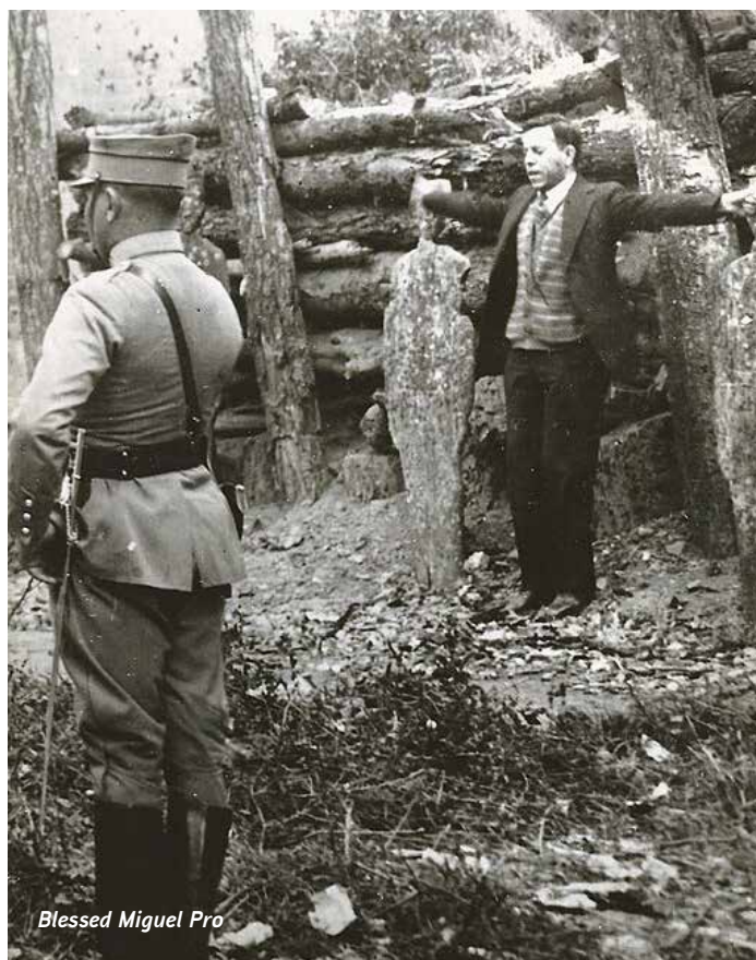
Blessed Miguel Pro