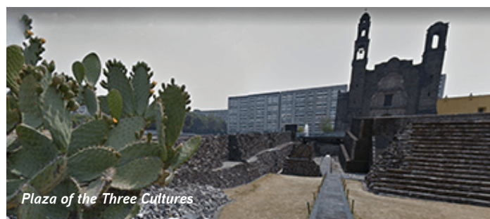
Plaza of the Three Cultures

Today marks the beginning of our pilgrimage as we depart on our flight to Mexico City. Upon arrival at the airport in Mexico City we will be met by our local guide, who will be with us for the duration of our pilgrimage. Time permitting, we enjoy a brief overview city tour before checking into our centrally located hotel for dinner and overnight. (D) Overnight Mexico City