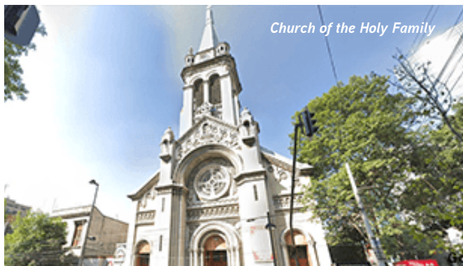
Church of the Holy Family

Depart Puebla this morning and return to Mexico City. Upon arrival, we proceed to the Metropolitan Cathedral. Afterwards, we will walk around the Zocalo, the Palacio Nacional, and the Templo Mayor (outside visit). Then continue on a tour of some of the other interesting sights of Mexico City including the House of Tiles and Reforma Avenue. We will also visit Bl. Miguel Pro's relics in the Church of the Holy Family and take a leisurely walk in Chapultepec Park and view the Don Quixote Fountain. (B, D) Overnight Mexico City