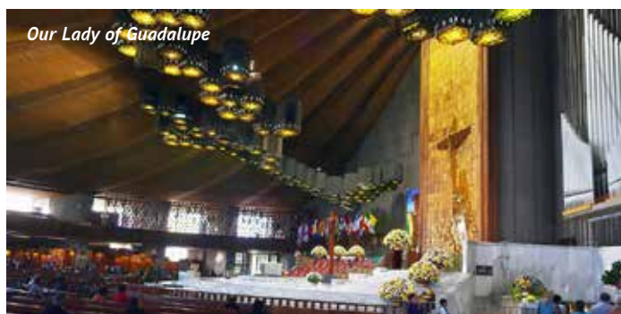
Our Lady of Guadalupe