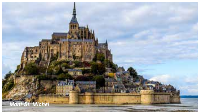
Mont St. Michel

St. Laurent to visit the National Cemetery and Omaha Beach, one of the sites where the Americans came ashore that day. Continue to the Pointe du Hoc with its impressive bomb craters. Later this afternoon, continue to the lovely seaside town of St. Malo for overnight. (B, D) - Overnight St. Malo