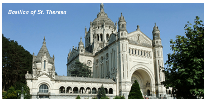
Basilica of St. Theresa

Upon arrival in Paris this morning we will be met at the airport by our guide (those arriving early will return to the airport to connect with the group). We then drive to Rouen, where our walking tour will explore its magnificent Gothic cathedral depicting scenes from the life of St. Joan of Arc and the Church of St. Joan of Arc, built near where she was burned to death. Proceed to Lisieux, the home of St. Therese the "Little Flower of Jesus," where we check into our hotel for dinner and overnight. (D) - Overnight Lisieux