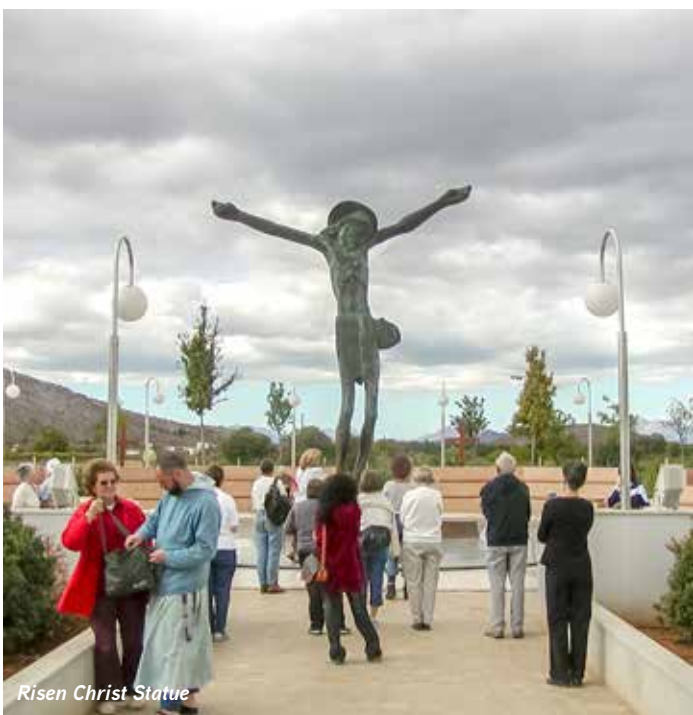
Risen Christ Statue