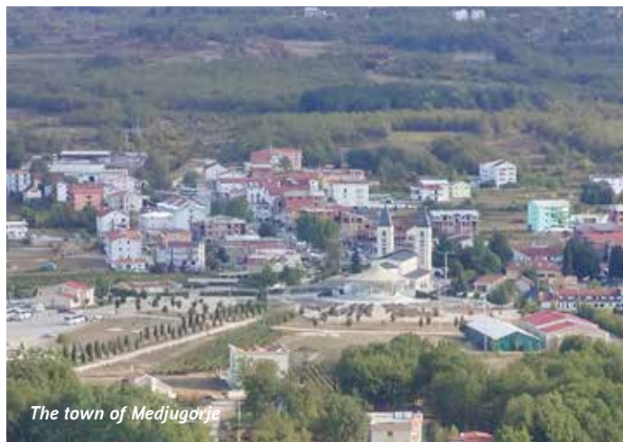
The town of Medjugorje