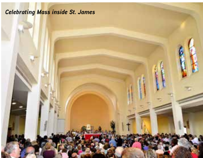
Celebrating Mass inside St. James