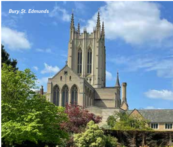
Bury St. Edmunds

Edmunds, where King Edmund (later St. Edmund) was martyred by the Danes in 869 and whose bones are buried in the Abbey. Then it is on to Norwich to visit the Cathedral and its cloisters, and the cell of Dame Julian, the great 14th century mystic. We also see some of the wonderful, old and interesting buildings, and picturesque gabled houses with crooked timbers and color washed plaster work before checking into our hotel for dinner and overnight. B, D - Overnight Norwich