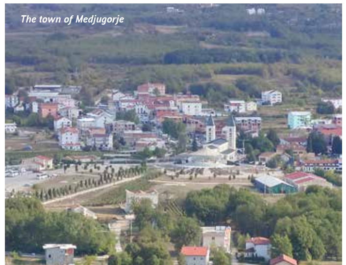
The town of Medjugorje

Pilgrims will spend 6 days in Medjugorje, participating in the daily spiritual life of St. James Church, which includes the English Mass, the evening program of prayer and adoration, as well as additional activities as outlined in the itinerary.