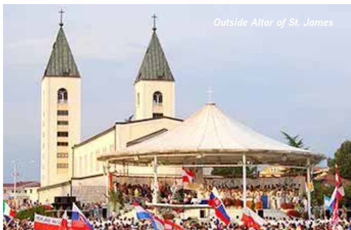
Outside Altar of St. James

“the Diocesan Bishop is encouraged to appreciate the pastoral value of this spiritual proposal, and even to promote its spread, including possibly through pilgrimages to a sacred site.”