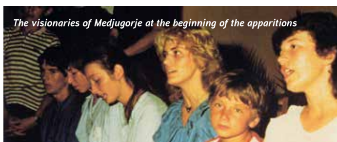
The visionaries of Medjugorje at the beginning of the apparitions