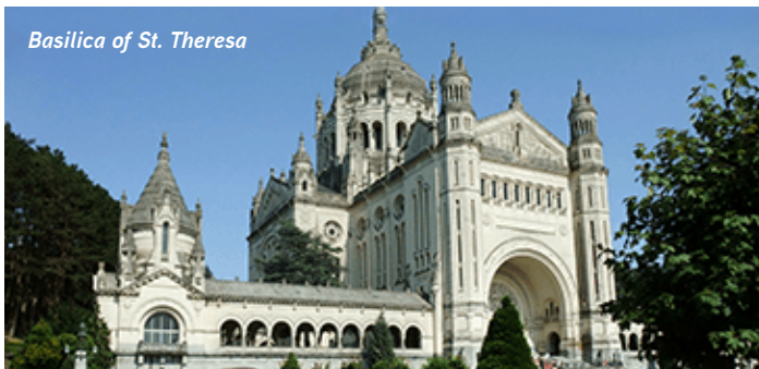
Basilica of St. Theresa

Upon arrival in Paris this morning we will be met at the airport by our guide. This morning we drive to Lisieux, the home of St. Therese the "Little Flower of Jesus" to visit the home where she lived as a child, the Carmelite Convent where she was a nun, the Basilica of St. Theresa for Mass, and Cathedral of St. Peter. (D) Overnight Lisieux