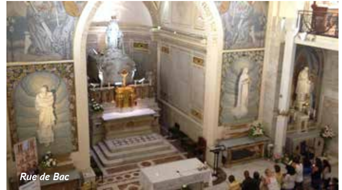
Rue de Bac