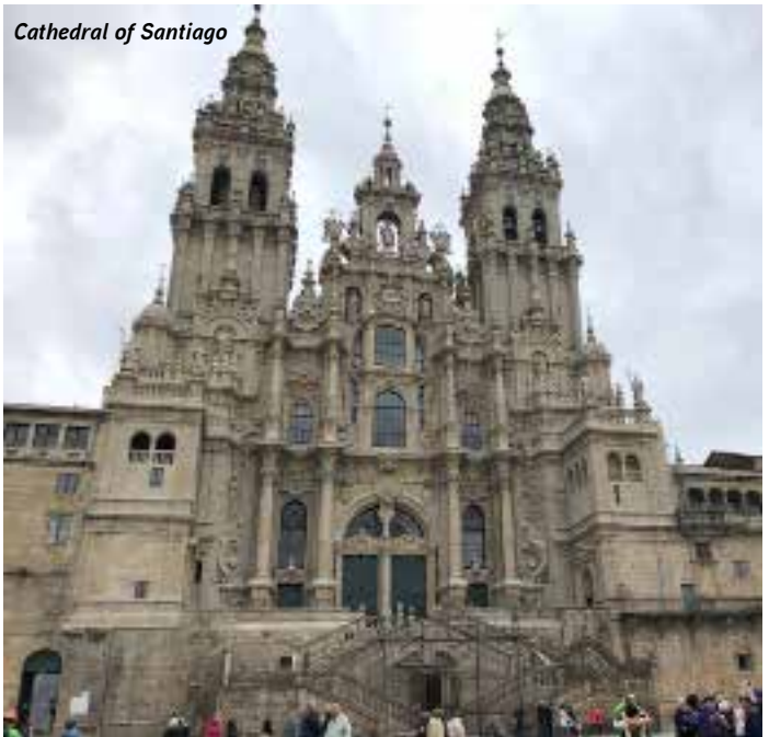
Cathedral of Santiago

Today we leave Arzua behind and meander along natural pathways through oak forests and lush meadows. The path today is mostly flat, with few gentle up-and-downhill sections. We have the opportunity to visit the medieval shrine at Santa Irene, our stopping point for the evening. There are legends surrounding the Baroque fountain at this shrine and the curative properties of the water that flows here. ( Overnight Melide )