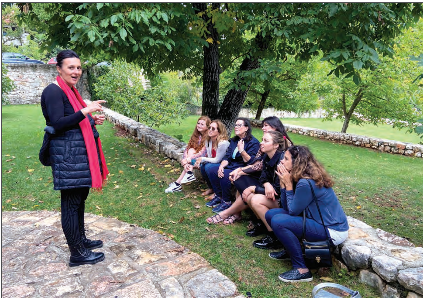
Our group, intensely listening to the powerful story of the Franciscans Friars, who were killed at the Monastery in Siroki Brijeg.