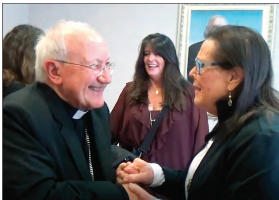
Archbishop Aldo Cavalli saying goodbye to our group after our meeting.