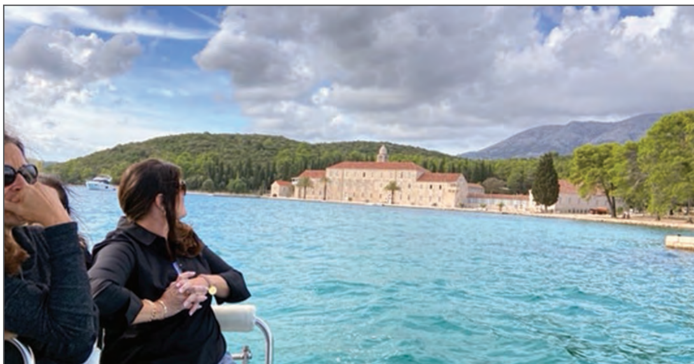
This is on the water taxi as we are leaving the monastery.