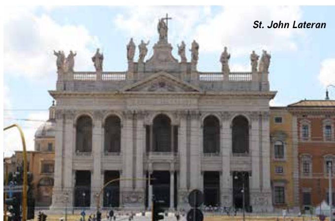
St. John Lateran

We begin today in Santa Croce in Gerusalemme where we get a little piece of Jerusalem thanks to Constantine's mother, St. Helena, who brought relics of the True Cross and the inscription part of the cross that stated Jesus was King of the Jews. At one time, soil from Jerusalem covered the Basilica's floor, so it truly was part of the Holy Land. After venerating these relics of Our Lord's crucifixion, we climb the Scala Santa (Holy Stairs), which our Lord climbed on His way to His condemnation, followed by the Basilica of St. John Lateran. Afterwards, we continue to St. St. Clement Basilica, which houses an original fresco depicting St. Clement celebrating the Holy Sacrifice of the Mass, giving us a picture of Eucharistic worship at the end of the first century or the beginning of the second. Lastly, we'll admire Michelangelo's magnificent statue of Moses inside St. Peter in Chains. Finally, we proceed to St. Mary Major where we venerate the crib of Christ, view the famous icon attributed to St. Luke, and see inestimable artwork that makes Rome renowned throughout the world. (B, D)