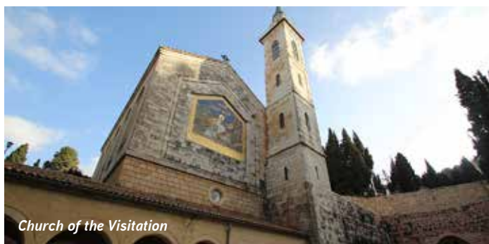
Church of the Visitation

We will take a morning drive to the top of the Mount of Olives for a panoramic view of Jerusalem and visit two churches located on the mount: the Church of the Pater Noster, built over the caves where Jesus taught His disciples how to pray the “Our Father,” and Ascension Chapel, the site from which Jesus ascended into Heaven. Descend the mount on the path Christ walked on the “Palm Sunday Road” to Dominus Flevit, where He wept over Jerusalem and her future destruction. Then enter into the Garden of Gethsemane where Christ had His agony and was betrayed. Here we will pray in the Church of All Nations at the Rock of Agony, the very rock where Christ prayed and sweated blood before He was crucified. This afternoon we drive to Ein Karem, one of the most beautiful sites in the New City of Jerusalem where St. John the Baptist was born. Marvel at the Visitation Church where Mary proclaimed her service to God in her Magnificat prayer and pray the Magnificat together in this holy site. Before returning to our hotel for the evening, we will visit the Saxum Center to learn more about the history of the Holy Land. (B, D)