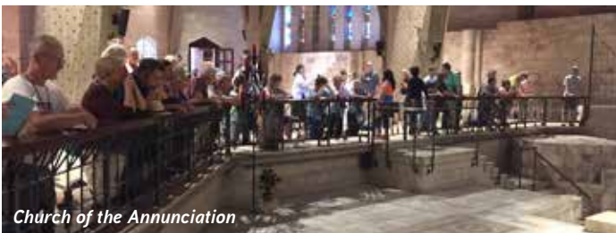
Church of the Annunciation

Set out for a morning drive along the Mediterranean Coast to Caesarea, the capital of the Roman Procurators of Judea where St. Peter preached, and St. Paul was imprisoned for two years. We will visit the Roman Theater and the Crusader's Moat and see the stunning architecture and art of the Byzantine Churches. This afternoon we will enter the port city of Haifa to ascend Mt. Carmel, the sacred mountain where the Prophet Elijah contested 450 prophets of Baal proclaiming, "The Lord, He is God," and Elisha, his disciple, took refuge. We will visit Stella Maris, the church dedicated to the Blessed Virgin Mary as Star of the Sea, located near the cave in which Elijah lived. We then continue along our way to our hotel in Tiberias, our home base for the next three nights. (B, D)