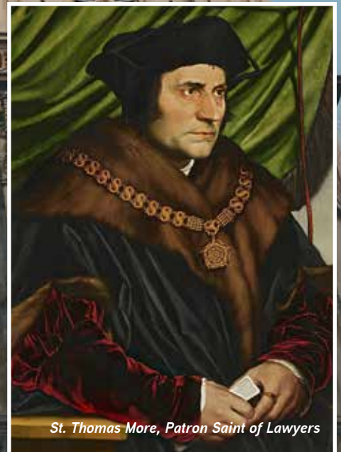
St. Thomas More, Patron Saint of Lawyers