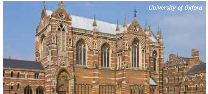
University of Oxford