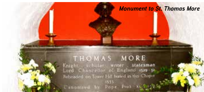
Monument to St. Thomas More

This morning we will begin on the Chelsea estate of St. Thomas More, where we can still see the mulberry tree planted by St. Thomas in what is now the garden of Allen Hall, the Seminary for the Diocese of Westminster. Proceed to Crosby Hall and view from the outside More's former London home, relocated and reconstructed in the 20th century. Visit Chelsea Old Church, site of the More family tomb, and the famous statue of St. Thomas More, commemorating him as "saint, scholar, and statesman." This afternoon, we will enjoy a tour of important London sites in St. Thomas More's early life, beginning with a journey down Milk Street, where he was born on February 7, 1478. Visit the church of St. Lawrence Jewry, the parish church of the More family, where St. Thomas lectured on St. Augustine's City of God. Continue to the Guildhall (subject to availability), London's oldest secular building, which sits on top of London's largest medieval crypt, housing a beautiful stained-glass window of St. Thomas. (B, D, Mass, CLE)