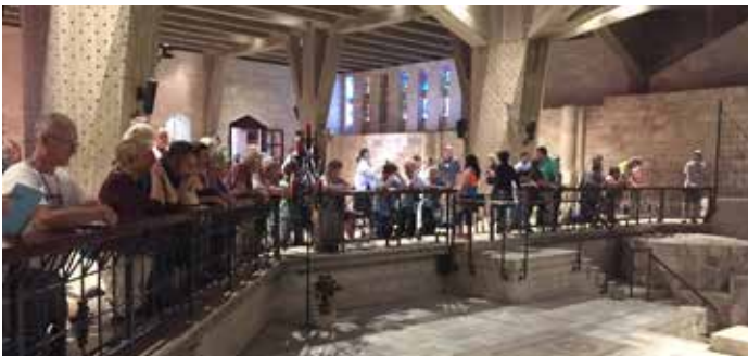
Church of the Annunciation

Set out for a morning drive along the Mediterranean Coast to Caesarea, the capital of the Roman Procurators of Judea where St. Peter preached, and St. Paul was imprisoned for two years. We will visit the Roman Theater and the Crusader's Moat and see the stunning architecture and art of the Byzantine Churches. This afternoon we will enter the port city of Haifa to ascend Mt. Carmel, the sacred mountain where the Prophet Elijah contested 450 prophets of Baal proclaiming "The Lord, He is God," and Elisha, his disciple, took refuge. We will visit Stella Maris, the church dedicated to the Blessed Virgin Mary as Star of the Sea, located near the cave in which Elijah lived. We then continue along our way to our hotel in Tiberias, our home base for the next three nights. (B, D, Mass)