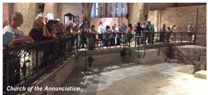
Church of the Annunciation

We drive to Cana in Galilee to pray where Jesus performed his first miracle, at the request of his mother, Mary, turning the water into wine. The Catholic Church points to this miracle as establishing the Sacrament of Marriage. Afterwards, travel a short distance to Nazareth, the childhood home of Jesus. Explore the Church of the Annunciation that holds the Cave of the Annunciation just behind the altar. This is the actual room where Gabriel appeared to Mary and "The Word was made flesh." (John 1:14.). See St. Joseph's Carpentry Shop, where the foster father of Jesus worked, and Mary's Well, where the Virgin Mary drew water with her Son for their daily living. We will take our last excursion of the day to the summit of Mt. Tabor, the site of the Transfiguration and the culminating point of Christ's public life. Christ revealed his divinity here to three of his apostles as he spoke with the prophets Moses and Elijah (Matthew 17). (B, D, Mass)