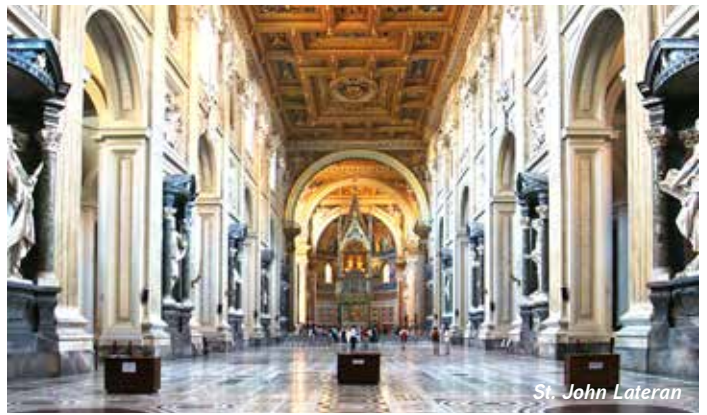
St. John Lateran

We begin our day today with an early Mass in St. Peter's Basilica where we contemplate centuries of history of the Catholic Church. Here we see the life-like Pieta statue by Michelangelo, stunning paintings, and the importance of Eucharistic Adoration at the chapel renovated under the direction of St. John Paul II. We then tour the Vatican Museum that hosts artifacts from around the world, some of the greatest depictions of the Eucharist in art, papal apartments, hand-woven intricate tapestries, and the stunning hallway of maps from the 1500s. The most famous ceiling in the world awaits us inside the Sistine Chapel. In the afternoon we'll journey to see the Holy Stairs and the Basilica of St. John Lateran, and end our day with a visit to St. Mary Major. Here we venerate the crib of Christ, view the famous icon painting attributed to St. Luke, and see inestimable artwork that makes Rome renowned throughout the world. (B, D, Mass)