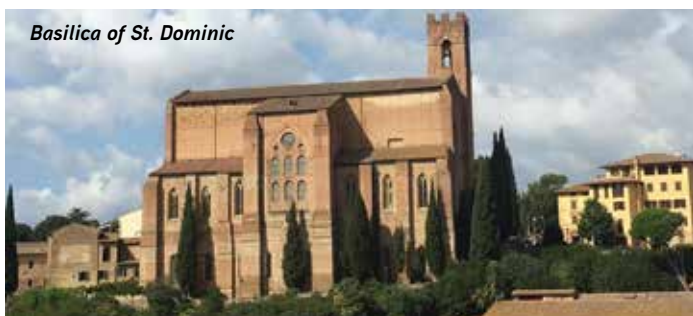
Basilica of St. Dominic

cell where she fasted and prayed. Afterwards, we stroll the ancient Gothic streets which converge on the Piazza del Campo, one of the most beautiful squares in the world. Enjoy some free time in this mystical walled city before continuing to Florence, our home for the next two nights. (B, D, Mass)