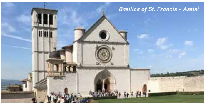
Basilica of St. Francis - Assisi

and see the Gothic Crucifix that spoke to St. Francis, asking him to "Rebuild my Church." Return to our hotel for our second night in this peaceful medieval town. (B, D, Mass)