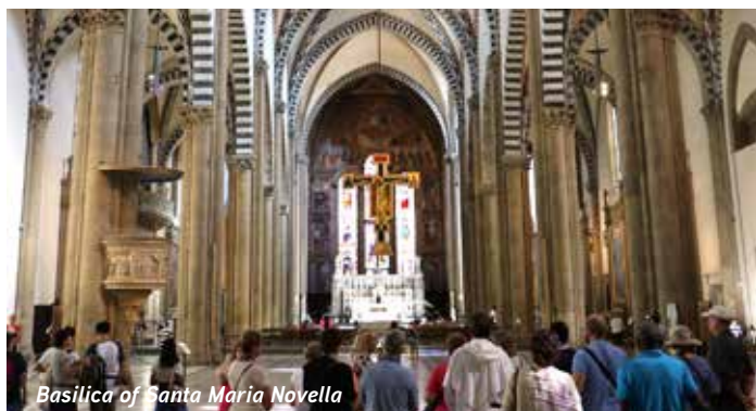
Basilica of Santa Maria Novella

We'll enjoy a full city tour of this magnificent Renaissance city today. Stroll the same streets Michelangelo, Leonardo Da Vinci, and Botticelli walked. Gaze at artwork so divine it is still moving hearts centuries after its creation. See the famous dome on Florence's cathedral, stare in awe at Michelangelo's statue of David, and walk along the Ponte Vecchio, the famous bridge designed by a Dominican friar. Visit the Baptistry chapel, with its bronze Gates of Paradise showcasing fabulous castings of the Old Testament. Continue onto Santa Maria Novella Church whose religious artwork is prized throughout the world. Enter the Santa Croce Church with its 16 chapels of superb frescoes by Giotto and see where Italy's most famous Italians are buried. The rest of the afternoon is free for your own discoveries until our farewell dinner later this evening. (B, D, Mass)