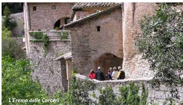
L'Eremo delle Carceri

Today will be a day of prayer and reflection, as we head up Monte Subasio this morning to L'Eremo delle Carceri (the Carceri Hermitage), the Saint's favorite retreat. There are many caves here that St. Francis and his followers retreated to for seclusion and prayer. The remainder of the day will be free for personal activities in this retreat-like setting, before descending once again into Assisi. (B, D, Mass)