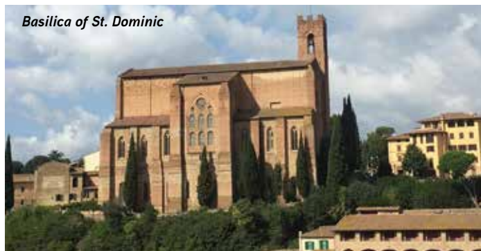
Basilica of St. Dominic