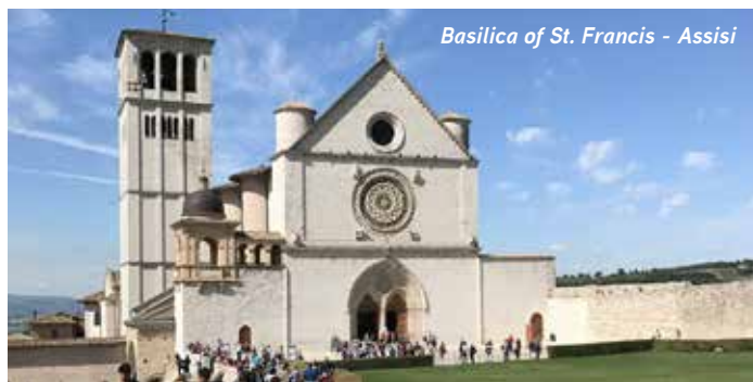
Basilica of St. Francis - Assisi

Our day begins with a visit to St. Mary of the Angels Basilica, site of the Porziuncola, the tiny church in the woods where St. Francis began his ministry and where St. Clare was consecrated. Continue to the Convent of San Damiano where the miracle of the Eucharist of 1211 took place and visit the chapel where Jesus spoke to St. Francis from the crucifix, and the Basilica of St. Francis. Finally, proceed to the Basilica of St. Clare to venerate her incorrupt body and see the Gothic Crucifix that spoke to St. Francis, asking him to "Rebuild my Church." Return to our hotel for our second night in this peaceful medieval town. (B, D, Mass)