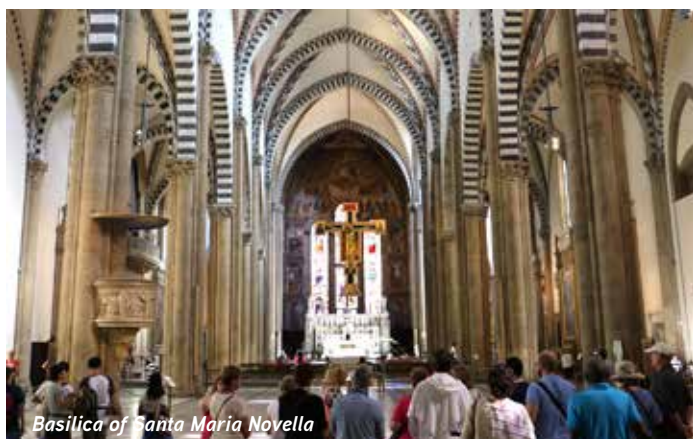
Basilica of Santa Maria Novella

We'll enjoy a full city tour of this magnificent Renaissance city today. Stroll the same streets Michelangelo, Leonardo Da Vinci, and Botticelli walked. Gaze at artwork so divine it is still moving hearts centuries after its creation. See the famous dome on Florence's cathedral, stare in awe at Michelangelo's statue of David, and walk along the Ponte Vecchio, the famous bridge designed by a Dominican friar. Visit the Baptistry chapel, with its bronze Gates of Paradise showcasing fabulous castings of the Old Testament. Continue onto Santa Maria Novella Church whose religious artwork is prized throughout the world. Enter the Santa Croce Church with its 16 chapels of superb frescoes by Giotto and see where Italy's most famous Italians are buried. The rest of the afternoon is free for your own discoveries until our farewell dinner later this evening. (B, D, Mass)