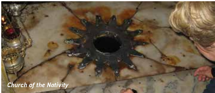
Church of the Nativity

We will take a morning drive to the top of the Mount of Olives for a panoramic view of Jerusalem and visit the Ascension Chapel, the site where Jesus ascended into Heaven. See the stone on which the imprint of His foot remains to this day. Descend the mount on the path Christ walked on the "Palm Sunday Road" and arrive at the Church of the Pater Noster where Jesus taught his disciples how to pray the "Our Father." Continue to Dominus Flevit, where Christ wept over Jerusalem and her future destruction. Then enter into the Garden of Gethsemane where Christ had his agony and was betrayed and where we will celebrate Mass. Keep watch with Christ and pray in the Church of All Nations at the Rock of Agony, the very rock where Christ prayed and sweated blood before he was to be crucified. In the afternoon, we drive to the neighborhood of Ein Karem, one of the most beautiful sites in the New City of Jerusalem where St. John the Baptist was born. Pray at the Visitation Church where Mary proclaimed her service to God in her Magnificat prayer after she came to visit her cousin Elizabeth. (B, D, Mass)