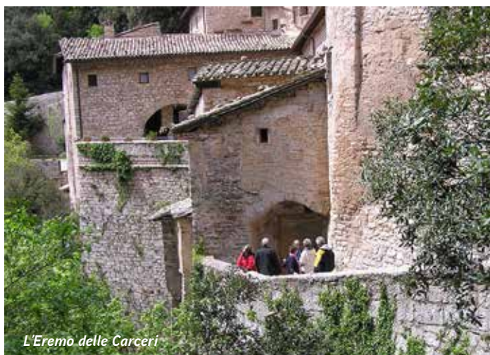
L'Eremo delle Carceri