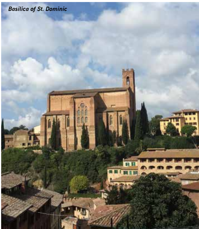
Basilica of St. Dominic

Today will be a day of prayer and reflection, as we head up Monte Subasio this morning to L'Eremo delle Carceri (the Carceri Hermitage), the Saint's favorite retreat. There are many caves here that St. Francis and his followers retreated to for seclusion and prayer. The remainder of the day will be free for personal activities in this retreat-like setting, before descending once again into Assisi. (B, D, Mass)