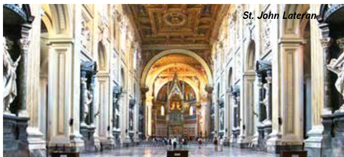
St. John Lateran

We'll begin today with Mass in St. Peter's Basilica, followed by a tour including the Pieta and Adoration Chape. Those who want can climb up to the Cupola of St. Peter's Basilica for a breathtaking view of Rome. Afterwards we will tour the Sistine Chapel and the Vatican Museum, focusing especially on Eucharistic art and artifacts. After lunch we'll visit the Holy Stairs and the Basilica of St. John Lateran. Enjoy dinner on your own at one of the many restaurants in Rome. (B, Mass)