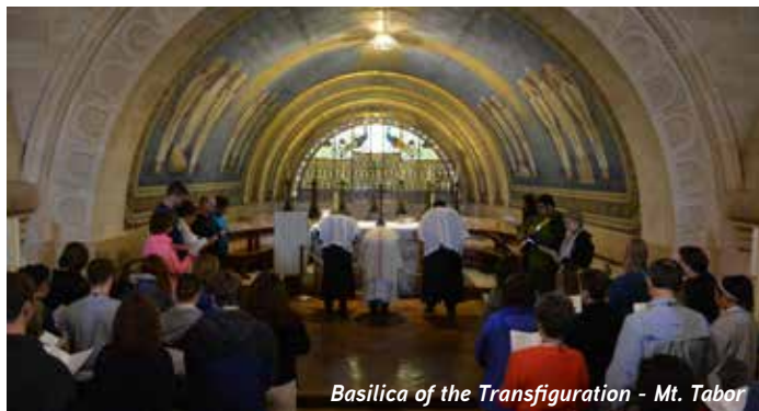
Basilica of the Transfiguration - Mt. Tabor

Following breakfast, we will drive to Cana of Galilee where Jesus, at the request of Mary, performed His first miracle: changing water into wine. It was here also that He blessed marriage and raised it to the dignity of a sacrament. If you wish, you may renew your wedding vows as a lasting remembrance