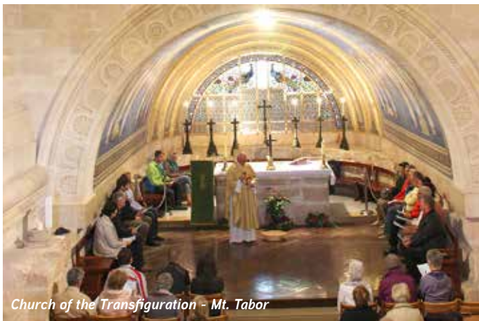
Church of the Transfiguration - Mt. Tabor

Set out for a morning drive along the Mediterranean Coast to Caesarea, the capital of the Roman Procurators of Judea where St. Peter preached and St. Paul was imprisoned for two years. Visit the Roman Theater, Crusader's Moat and see the stunning architecture and art of the Byzantine Churches. We then enter the port city of Haifa to ascend Mt. Carmel, the sacred mountain where the Prophet Elijah contested 450 prophets of Baal proclaiming "The Lord, He is God," and Elisha, his disciple, took refuge. Visit Stella Maris, the church dedicated to the Blessed Virgin Mary as Star of the Sea. It sits near the cave in which Elijah lived. This afternoon, we drive to Cana in Galilee to pray where Jesus performed His first miracle, at the request of His mother, Mary, turning the water into wine. The Catholic Church points to this miracle as establishing the Sacrament of Marriage. If you wish, you may renew your wedding vows here as a lasting remembrance of this holy site. Proceed to our hotel in Galilee, our home for the next three nights. (B, D, Mass)