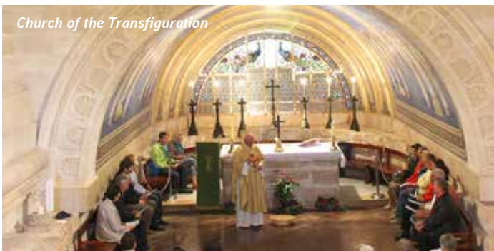
Church of the Transfiguration

We drive to Cana in Galilee to pray where Jesus performed his first miracle, at the request of his mother, Mary, turning the water into wine. The Catholic Church points to this miracle as establishing the Sacrament of Marriage. If you wish, you may renew your wedding vows here as a lasting remembrance of this holy site. Afterwards,