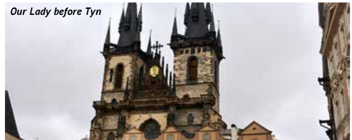
Our Lady before Tyn

This morning we will cross the Charles Bridge to visit the Old Town, which is considered to be one of the best historical city centers in Europe. Visit the Old Town Square, the Town Hall with its famous Astronomical Clock which comes alive when the hour strikes and the twelve disciples appear to bless the crowd, the Church of Our Lady before Tyn, and the Church of St. Nicholas. In the afternoon we will take an excursion to Kutna Hora to see the Sedlec Ossuary, popularly referred to as the “Bone Church” which contains the exhumed remains of up to 40,000 people. This evening enjoy a farewell dinner at a local restaurant. (B/D, Mass)