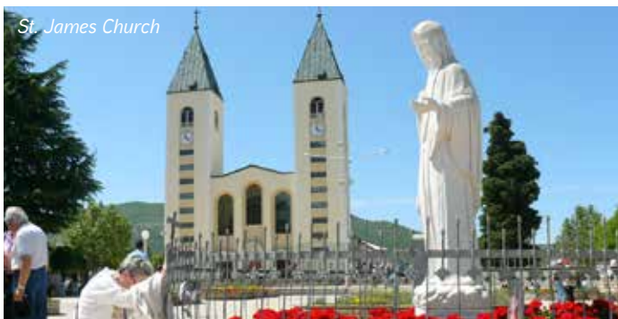
St. James Church

● We will climb Apparition Hill, site where Our Lady first appeared to the visionaries.