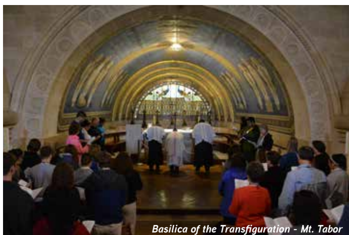
Basilica of the Transfiguration - Mt. Tabor

This morning we will depart Tiberias and travel south through the Jordan valley to the traditional baptismal site on the River Jordan to renew our baptismal vows. The Bible tells us that the Children of Israel crossed the River Jordan opposite Jericho when they came into the Promised Land. The prophet Elijah divided its waters and crossed with Elisha on dry land. Naaman the Syrian dipped in the waters seven times and was cured of his leprosy. And Jesus was baptized by John in the Jordan (Mark 1:9). Each year, pilgrims from far and wide come to the Place of Baptism to immerse themselves in these holy waters. From here, we will visit ancient Jericho, the oldest known city in the Western world. In 1250 B.C., Joshua encircled the city and at the blast of the priests' trumpets, the walls came tumbling down (Joshua 6). Many times Jesus passed through this city on his way to Jerusalem. From the ruins of ancient Jericho, we will ascend the Mount of Temptation where Jesus fasted and prayed forty days to resist the devil. Next we will stop in Bethany to visit the site of the House of Mary, Martha & Lazarus and the Tomb of Lazarus. After Mass in Bethany we will continue on to Jerusalem, our home for the next six nights.