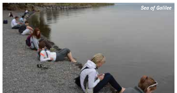
Sea of Galilee