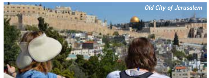
Old City of Jerusalem