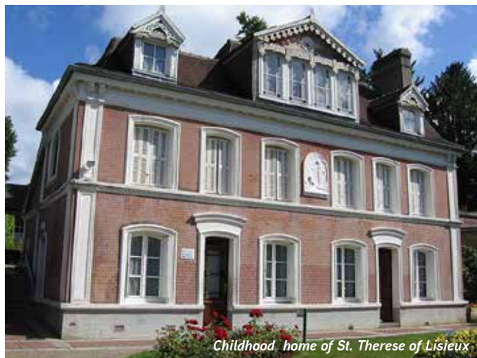
Childhood home of St. Therese of Lisieux