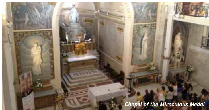
Chapel of the Miraculous Medal

We board the plane this morning and head back home again to Indiana.