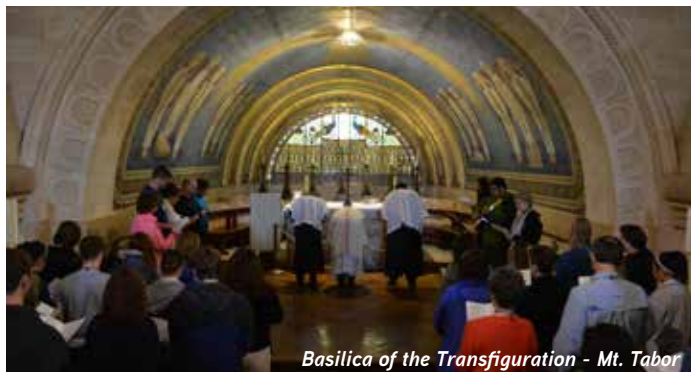
Basilica of the Transfiguration - Mt. Tabor

This morning, we will visit the sites around the Sea of Galilee, where Jesus first called John and spent much of his time with the Beloved Disciple. We will begin with a scenic boat ride