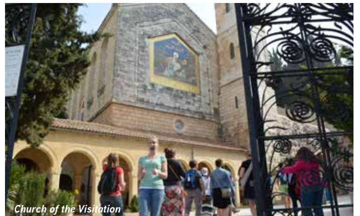
Church of the Visitation

After morning Mass at the Mt. of the Beatitudes we will depart Galilee and drive to the original site on the River Jordan where Christ was baptized, and renew our baptismal vows. The Bible tells us that the Children of Israel crossed the River Jordan opposite Jericho when they came into the Promised Land. The prophet Elijah divided its waters and crossed with Elisha on dry land. Naaman the Syrian dipped in the waters seven times and was cured of his leprosy. And Jesus was baptized by John in the Jordan (John 1:32). Each year, pilgrims from far and wide come to the Place of Baptism to immerse themselves in these holy waters. Continue our drive up through the winding mountain roads to Jerusalem, our home for the next four nights.