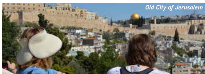
Old City of Jerusalem