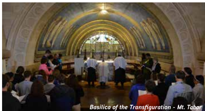
Basilica of the Transfiguration - Mt. Tabor

This morning, we will enjoy a scenic boat ride across the Sea of Galilee and proceed to the Church of Peter's Primacy