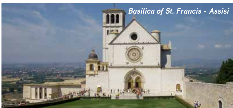
Basilica of St. Francis - Assisi