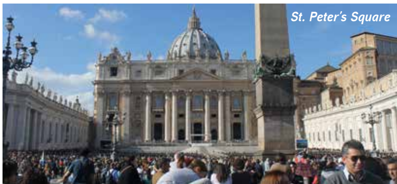
St. Peter's Square