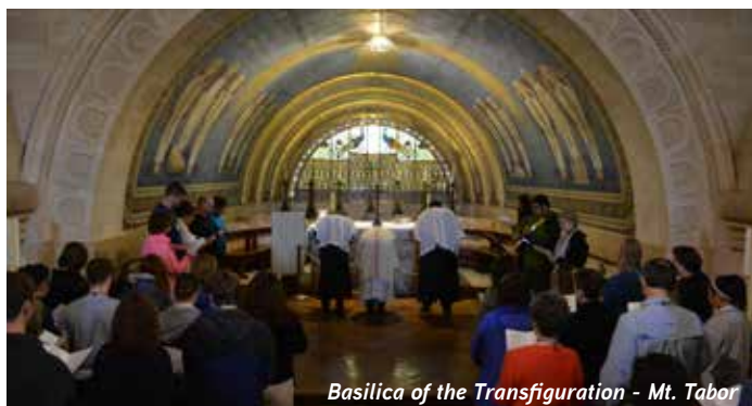
Basilica of the Transfiguration - Mt. Tabor

After Mass at the Mount of the Beatitudes, we will travel around the Sea of Galilee and stop at Kursi. Here Jesus met a possessed man and miraculously cast out a legion of demons into the herd of swine (Luke 8:26). From there we will ascend the Golan Heights and stop at the Banias Spring that rises from under a cave and is one of the sources of the Jordan River. It was here near Banias at ancient Caesarea Philippi where Peter made his confession of faith in Jesus. In the afternoon, head south through the Judean wilderness to the site of the Baptism of the Lord and renew our baptismal vows. The Bible tells us that the Children of Israel crossed the River Jordan opposite Jericho when they came into the Promised Land. The prophet Elijah divided its waters and crossed with Elisha on dry land. Naaman the Syrian dipped in the waters seven times and was cured of his leprosy. And Jesus was baptized by John in the Jordan (Mark 1:9). Each year, pilgrims from far and wide come to the Place of Baptism to immerse themselves in these holy waters. From here, we will have a short drive to Jerusalem.