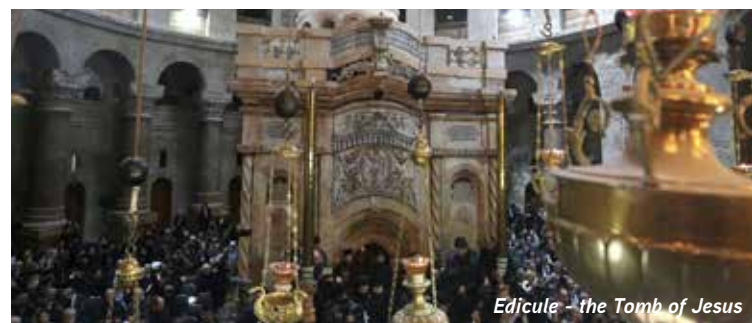
Edicule - the Tomb of Jesus

Today our Holy Land pilgrimage comes to an end. We will transfer to the airport for our return flight home.