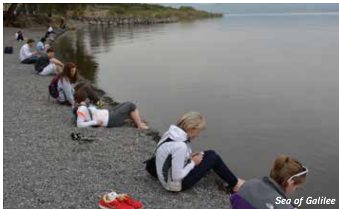
Sea of Galilee