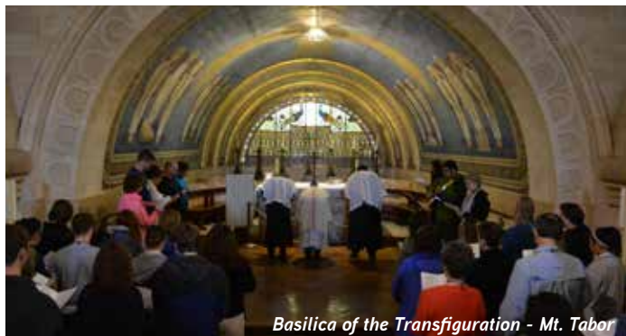
Basilica of the Transfiguration - Mt. Tabor

This morning we will depart Tiberias and travel south through the Jordan valley to the traditional baptismal site on the River Jordan to renew our baptismal vows. The Bible tells us that the Children of Israel crossed the River Jordan opposite Jericho when they came into the Promised Land. The prophet Elijah divided its waters and crossed with Elisha on dry land. Naaman the Syrian dipped in the waters seven times and was cured of his leprosy. And Jesus was baptized by John in the Jordan (Mark 1:9). Each year, pilgrims from far and wide come to the Place of Baptism to immerse themselves in these holy waters. From here, we will visit ancient Jericho, the oldest known city in the Western world. In 1250 B.C., Joshua encircled the city and at the blast of the priests' trumpets, the walls came tumbling down (Joshua 6). Many times Jesus passed through this city on his way to Jerusalem. The sycamore fig, the tree which Zacchaeus climbed in order to catch a glimpse of Jesus, still grows in this area. From the ruins of ancient Jericho, we will ascend the Mount of Temptation where Jesus fasted and prayed forty days to resist the devil. We continue on to Jerusalem, our home for the next five nights.