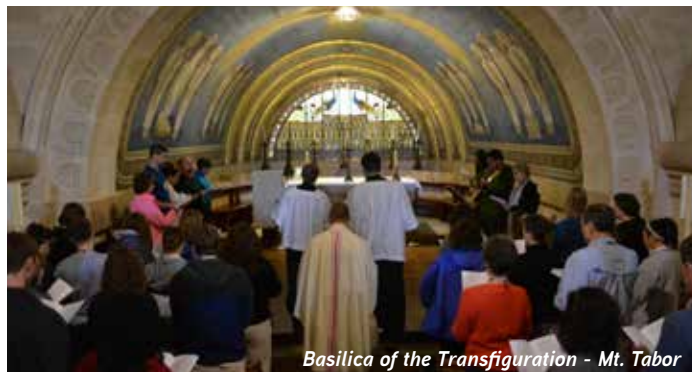
Basilica of the Transfiguration - Mt. Tabor

Following breakfast, we will drive to Cana of Galilee where Jesus, at the request of Mary, performed His first miracle... changing water into wine. It was here also that He blessed marriage and raised it to the dignity of a sacrament. If you wish, you may renew your wedding vows as a lasting remembrance of this holy site. From there, we go a short distance to Nazareth, the boyhood home of Jesus. In the Church of the Annunciation we will celebrate Mass. Just behind the altar, at the Cave of the Annunciation, we will see the actual room in which Mary said "yes" to the angel Gabriel. From there we will visit St. Joseph's Carpentry Shop and Mary's well. In the afternoon,