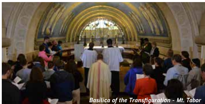
Basilica of the Transfiguration - Mt. Tabor

This morning we will enter the Old City of Jerusalem through St. Stephen’s Gate to visit the Church of St. Anne, where the Blessed Virgin Mary was born. Next to this site is the Pool of Bethesda, where Jesus healed the paralytic man. We will then walk the Via Dolorosa finishing prayerfully in the Church of the Holy Sepulchre. There we will climb Mt. Calvary and pray at the site of the crucifixion. We will venerate the site where Jesus’ body was anointed, the tomb where he was buried and rose from the dead, and the Chapel of St. Helena