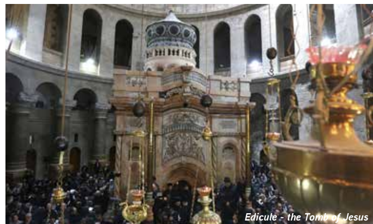
Edicule - the Tomb of Jesus

Today our Holy Land pilgrimage comes to an end. We will transfer to the airport in Tel Aviv for our return flight home.