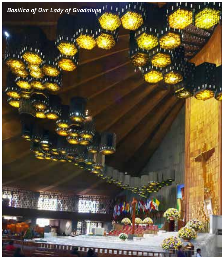
Basilica of Our Lady of Guadalupe