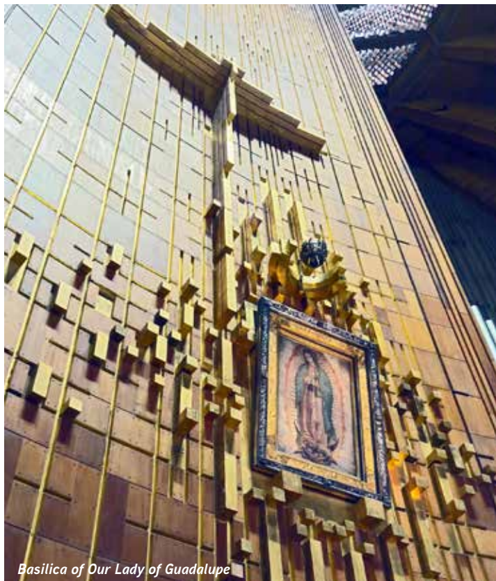
Basilica of Our Lady of Guadalupe