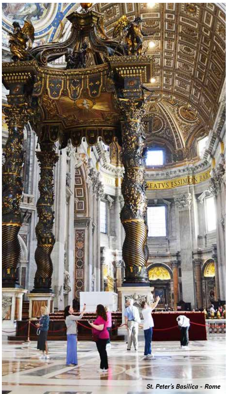
St. Peter's Basilica - Rome

Transfer to the airport to catch our return flight home.