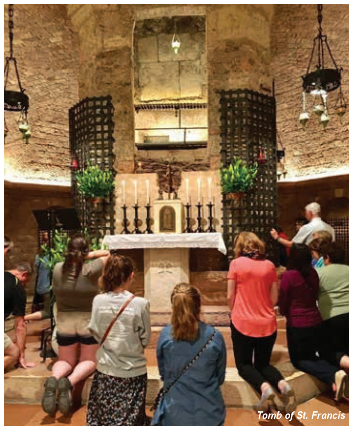
Tomb of St. Francis

In the morning, we will depart Assisi and drive north to Siena, home of St. Catherine. Our first stop this morning and a