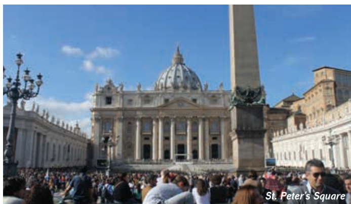
St. Peter's Square