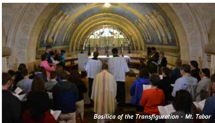
Basilica of the Transfiguration - Mt. Tabor

This morning we will depart Tiberias and travel south through the Jordan valley to the traditional baptismal site on the River Jordan to renew our baptismal vows. The Bible tells us that the Children of Israel crossed the River Jordan opposite Jericho when they came into the Promised Land. The prophet Elijah divided its waters and crossed with Elisha on dry land. Naaman the Syrian dipped in the waters seven times and was cured of his leprosy. And Jesus was baptized by John in the Jordan (Mark 1:9). Each year, pilgrims from far and wide come to the Place of Baptism to immerse themselves in these holy waters. From here, we will visit ancient Jericho, the oldest known city in the Western world. In 1250 B.C., Joshua encircled the city and at the blast of the priests' trumpets, the walls came tumbling down (Joshua 6). Many times Jesus passed through this city on his way to Jerusalem. The sycamore fig, the tree which Zacchaeus climbed in order to catch a glimpse of Jesus, still grows in this area. From the ruins of ancient Jericho, we will ascend the Mount of Temptation where Jesus fasted and prayed forty days to resist the devil. Then drive to the Dead Sea for a swim in its salty, mineral-laden waters. Lastly, we will stop in Bethany to visit the site of the House of Mary, Martha & Lazarus and the Tomb of Lazarus. After Mass, we will continue on to Jerusalem, our home for the next five nights.