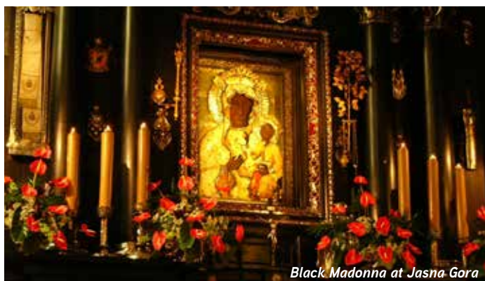
Black Madonna at Jasna Gora