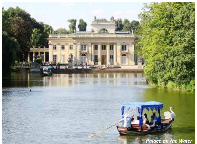
Palace on the Water