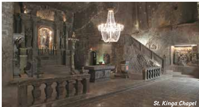
St. Kinga Chapel

This morning we will visit Kalwaria Zebrzydowska which was a popular pilgrimage place for Pope John Paul II when he was a young man and where in the 17th century the Palatine of Krakow founded a Franciscan Monastery. On the slope of the hill and the valley is an architectural 'Way of the Cross' made up of 40 chapels set on the surrounding hills. After Mass we will drive