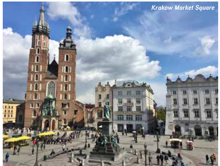
Krakow Market Square

Following breakfast, proceed to Wawel Hill and celebrate Mass at the Cathedral of St. Stanislaw, Poland's second most