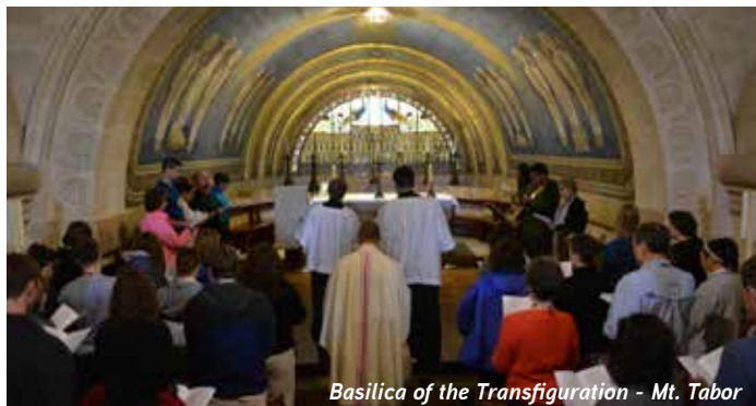
Basilica of the Transfiguration - Mt. Tabor

This morning we will go to Mount Zion to visit the Upper Room, the site where Jesus celebrated the Last Supper. We share Mass and Eucharist together in the crypt at the Church