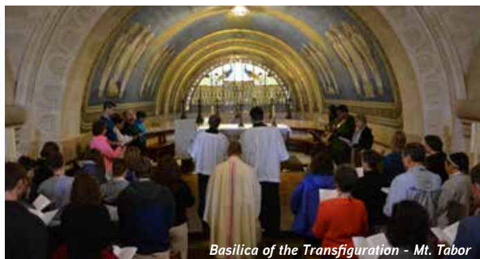
Basilica of the Transfiguration - Mt. Tabor

Following breakfast, we will drive to Cana of Galilee where Jesus, at the request of Mary, performed His first miracle...changing water into wine. It was here also that He blessed marriage and raised it to the dignity of a sacrament. If you wish, you may renew your wedding vows as a lasting remembrance of this holy site. From there, we go a short distance to Nazareth, the boyhood home of Jesus. In the Church of the Annunciation we will celebrate Mass. Just behind the altar, at the Cave of the Annunciation, we will see the actual room in which Mary said "yes" to the angel Gabriel. From there we will visit St. Joseph's Carpentry Shop and Mary's well. In the afternoon, we will take an excursion to the summit