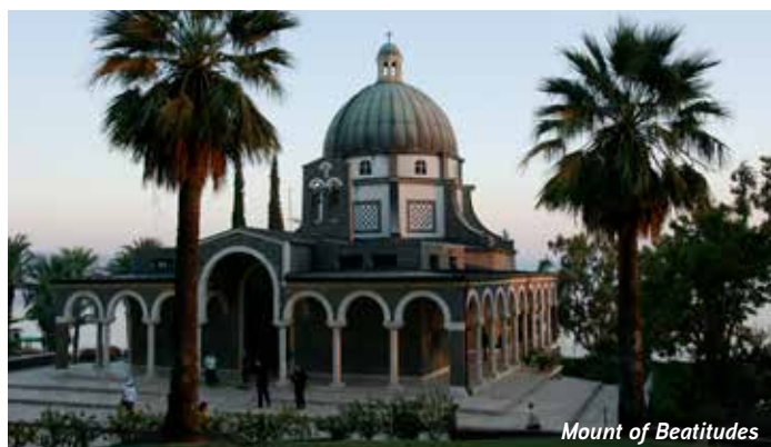
Mount of Beatitudes