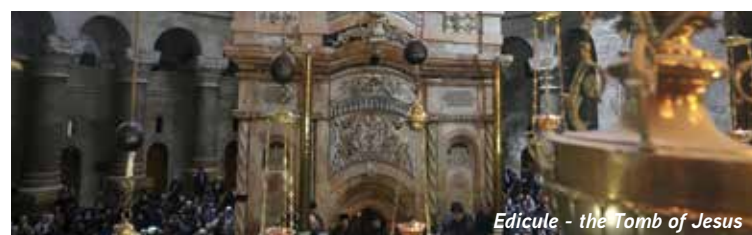
Edicule - the Tomb of Jesus

We will drive to Bethany to visit the site of the House of Mary, Martha & Lazarus and the Tomb of Lazarus. Then drive to ancient Jericho, the oldest known city in the Western world. In 1250 B.C., Joshua encircled the city and at the blast of the priests' trumpets, the walls came tumbling down (1 Kings 16). Many times Jesus passed through this city on his way to Jerusalem. The sycamore fig, the tree which Zacchaeus climbed in order to catch a glimpse of Jesus, still grows in this area. From the ruins of ancient Jericho, we will ascend the Mount of Temptation where Jesus fasted and prayed forty days to resist the devil. Next we will make a stop at the Dead Sea where you may want to take a swim. Return to Jerusalem and enjoy a farewell dinner this evening and transfer to Ben Gurion Airport in Tel Aviv to catch our late evening return flight home.