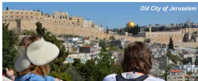
Old City of Jerusalem

Register online at: www.tektonministries.org