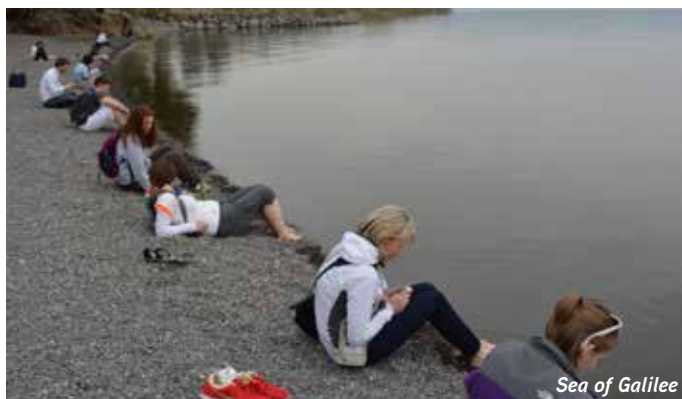
Sea of Galilee