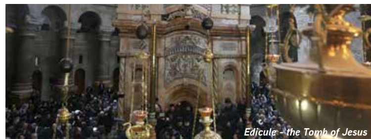
Edicule – the Tomb of Jesus

Today our Holy Land pilgrimage comes to an end as we transfer to the airport in Tel Aviv to catch our return flight home.