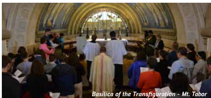
Basilica of the Transfiguration - Mt. Tabor

Following breakfast, we will drive to Cana of Galilee where Jesus, at the request of Mary, performed His first miracle... changing water into wine. It was here also that He blessed marriage and raised it to the dignity of a sacrament. If you wish, you may renew your wedding vows as a lasting remembrance of this holy site. From there, we go a short distance to Nazareth, the boyhood home of Jesus. In the Church of the Annunciation we will celebrate Mass. Just behind the altar, at the Cave of the Annunciation, we will see the actual room in which Mary said "yes" to the angel Gabriel. From there we will visit St. Joseph's Carpentry Shop and Mary's well. In the afternoon, we will take an excursion to the summit of Mt. Tabor where Jesus transfigured himself and revealed his Divine Glory to the apostles (Matt 17:2).