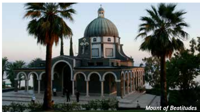
Mount of Beatitudes

This morning visit the Tomb of Maimonides followed by a stop in the ancient center of Jewish mysticism - Safed. The narrow cobblestone alleys reveal artists’ galleries, medieval synagogues, private homes and small guest houses. We will tour one of the medieval synagogues, then make a short stop in Chorazin, one of the three towns cursed by Our Lord for their lack of faith (Lk. 10). Later, ascend the Golan Heights and stop at the Banias Spring that rises from under a cave and is one of the sources of the Jordan River. It was here, the ancient Caesarea Philippi, where after Peter made his confession of faith, Jesus said “You are Peter, and on this rock I will build my church.” (Mt. 16) On our return to Tiberias we will travel around the Sea of Galilee and stop at Kursi. Here Jesus met a possessed man and miraculously cast out a legion of demons into the herd of swine (Lk. 8:26).