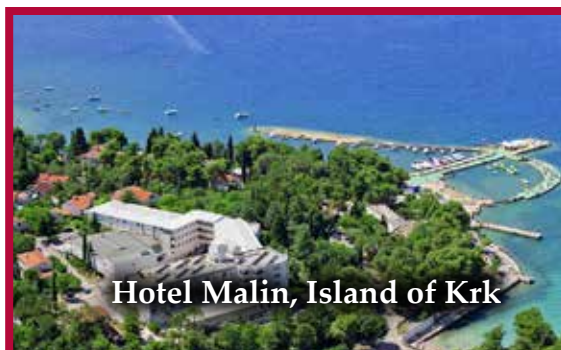
Hotel Malin, Island of Krk