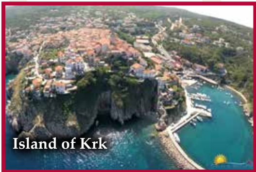
Island of Krk