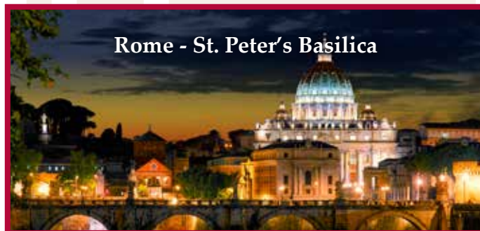
Rome - St. Peter's Basilica

This morning we will depart Assisi and drive to Cascia where we will visit the Shrine of St. Rita. We will then proceed to the medieval town of Greccio. Greccio itself, set on a beautiful mountaintop, is famous for its cool summer climate and its mineral springs. However, it is even more renowned for its connections with St. Francis of Assisi and as the birthplace of the Christmas crèche. On Christmas Night 1223, St. Francis led shepherds to the top of a nearby hill where they gathered together in a stable sheltering an ox and a donkey. According to legend, the Baby Jesus miraculously appeared in