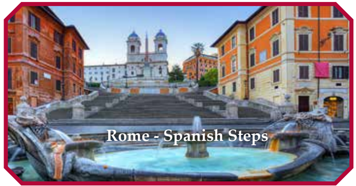
Rome - Spanish Steps

Following breakfast, we will transfer to the airport to catch our return flight home. (B)