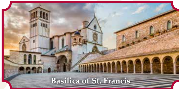
Basilica of St. Francis