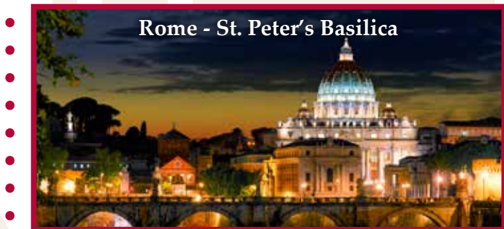
Rome - St. Peter's Basilica

• Capuchin Monastery where he lived, the Church of Santa Maria delle Grazie, the Padre Pio Pilgrimage Church which was completed in 2004 and Padre Pio’s Tomb. We will then depart San Giovanni Rotondo and proceed to the ‘Eternal City’ of Rome. This evening we will break up into smaller groups and enjoy dinner at local restaurants. (B)