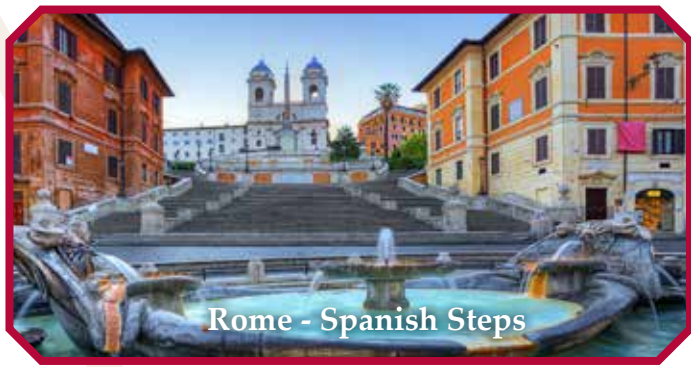
Rome - Spanish Steps

Following breakfast, we will transfer to the airport to catch our return flight home. (B)